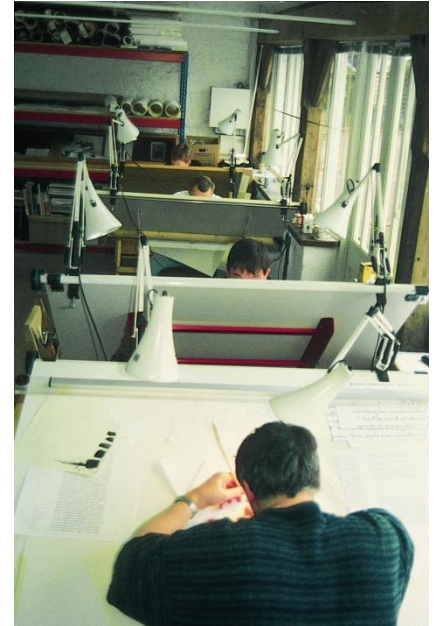
Silence fills the Scriptorium as scribes write at their desks with complete concentration.

Stencils and stamps are used to apply paint and gold powder throughout, creating a rich visual vocabulary. Stencils and stamps are made from computer images and provide recurring elements within and across volumes of The Saint John's Bible .