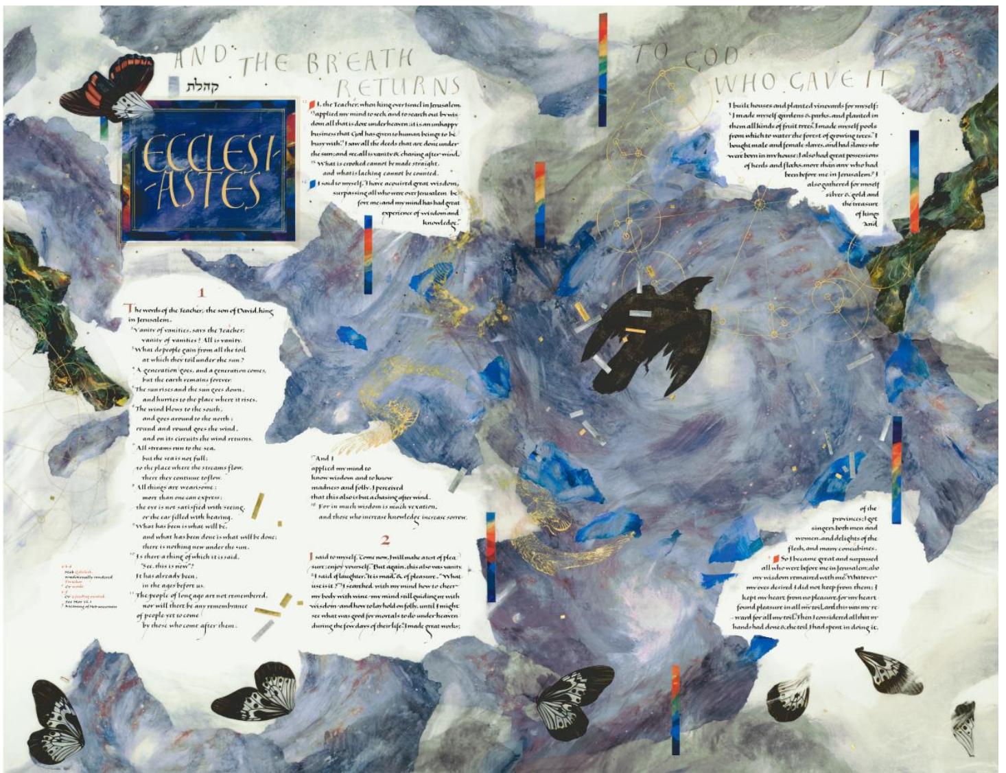
Donald Jackson, 2006 Scribe: Donald Jackson Ecclesiastes Frontispiece (Ecclesiastes 1:1 – 2:11 NRSV Translation) Vellum, with ink, paint, silver and gold Hill Museum & Manuscript Library, Collegeville, MN